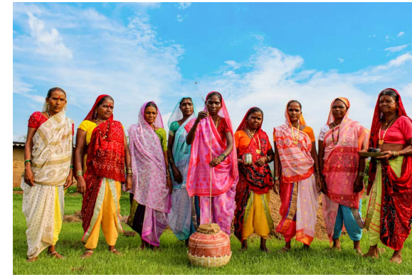
Dera Geet sung with earthen pots and peacock feathers

Across villages, songs preserve collective memory: