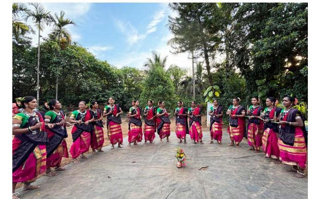
Tipri Geet devotional songs to local deities