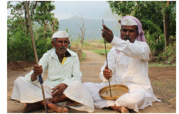
Thali Badya rhythmic metal plate performances