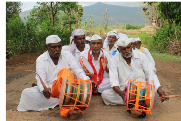
Dhak Badya poetic exchanges of humour and wisdom